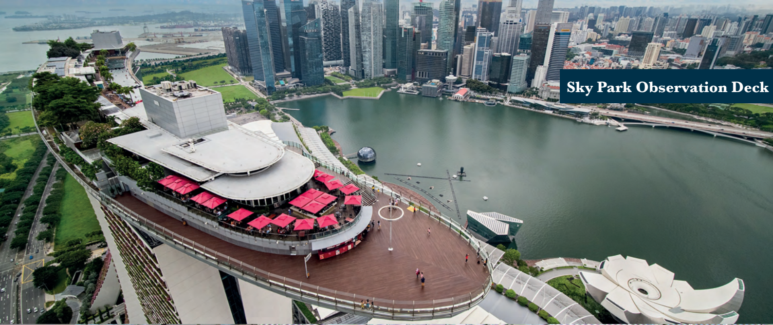
Sky Park Observation Deck